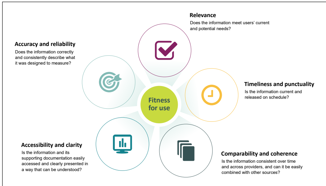
Figure 1 5 dimensions of quality

The quality dimensions are not mutually exclusive and need to be balanced against one another to best meet users' needs. Sometimes improvements in one dimension can lead to a deterioration in another dimension (e.g., changing the data collected within a data holding would increase its relevance but affect the ability to compare over time). Trade-offs between dimensions are often made (e.g., a reduction in accuracy may be acceptable to improve timeliness). There are also other considerations that are taken into account when producing information products that can have an impact on their overall quality or that may influence decisions about potential improvement initiatives. These include cost, resource availability, collection burden, privacy, confidentiality and security. 2